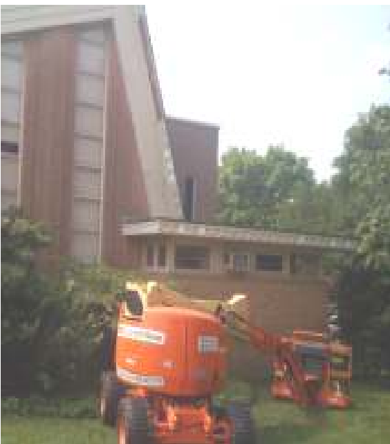
August 2009: Our building gets a fresh coat of paint, and in some places, more than that!