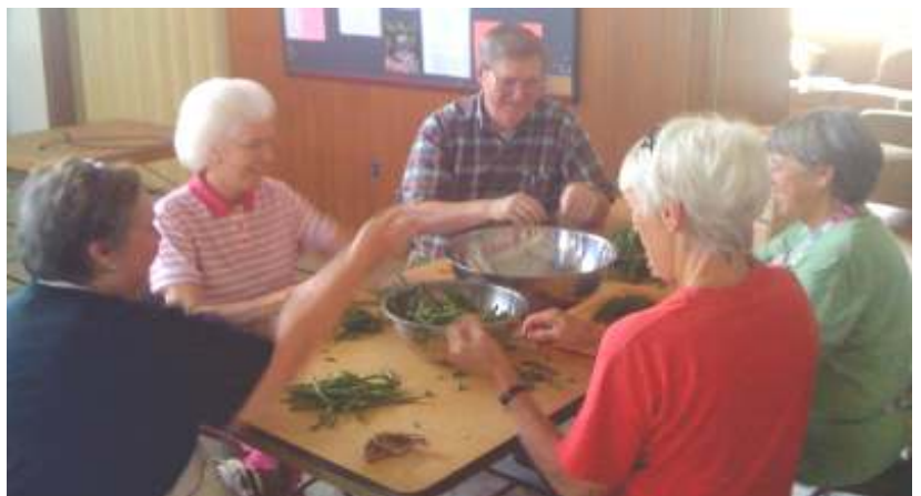
Emmanuel Dining Room meal preparations take place on the 19th of each month here at First Unitarian Church. Although it was a hot steamy day, our crew came in and made quick work of preparing the meal that would be served by our volunteers the next day at the Emmanuel Dining Room in Wilmington. Upwards of 200 people are served a hot, nutritious meal daily there. Our prep cooks could be heard laughing and conversing as they snapped beans, baked chicken and cooked rice.